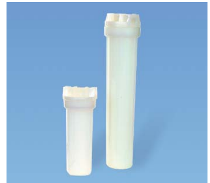
Virgin Polypro DOE & "222"