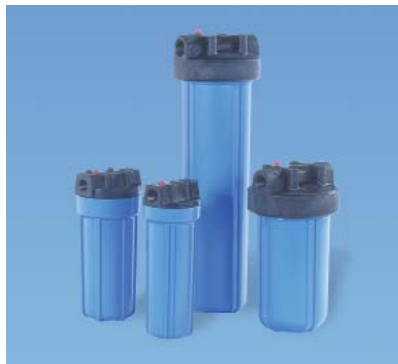
Blue / Black