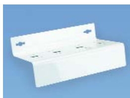
FM-35AW (For 5000 & 10000)