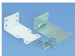
FM-10 & FM10W (For 500, 4200 & 7000)