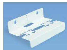
FM-30 (500, 4000, 4200, 7000)