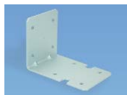
FM25A (For 5000 & 10000)