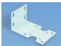
FM-20 (For 4500 & 8000)