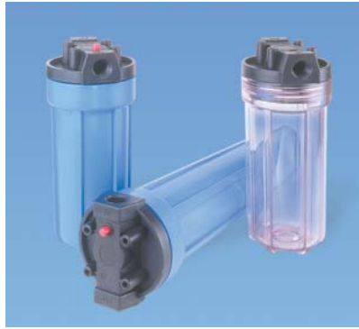
Commercial Series 4500 (10") & 8000 (20")