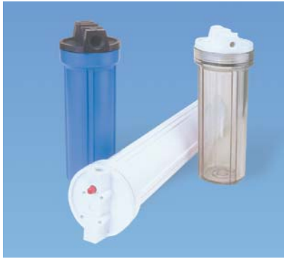
Residential Series 4200 (10") & 7000 (20")