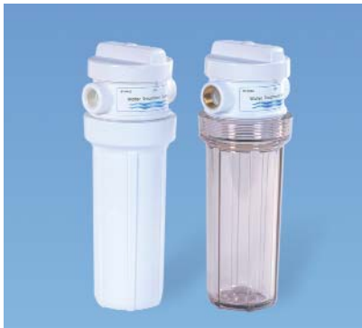
Valve-In-Head Opaque & Clear