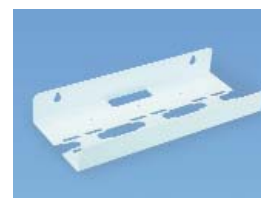
FM-60 (For 500, 4200, 7000)