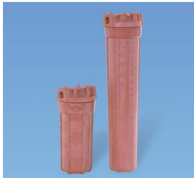
High Temp 4500HT (10") & 8000HT (20")