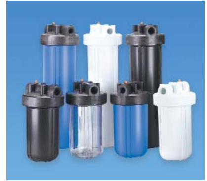
Full-Flow (B-B) Series 5000 (10") & 10000 (20")