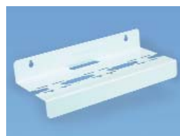
FM-50 (For 500, 4200, 7000)