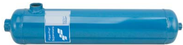
Flow-Pro in-line centrifugal separator