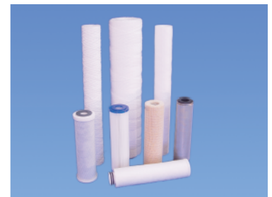
Shelco manufactures a complete Line of elements for your application